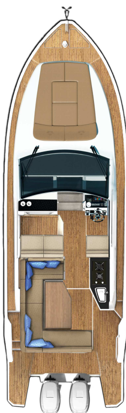
MAIN DECK with extended bathing platform