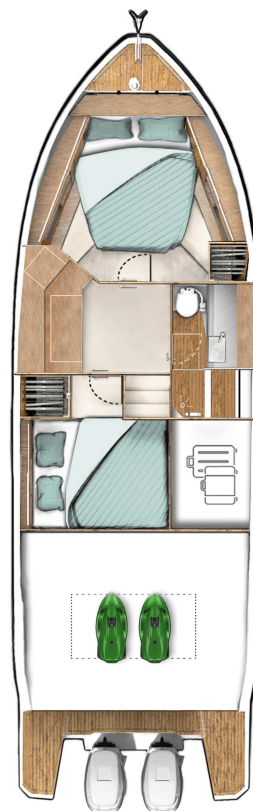
LOWER DECK standard