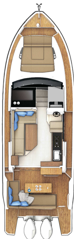
MAIN DECK optional with fixed cockpit table and extended bathing platform