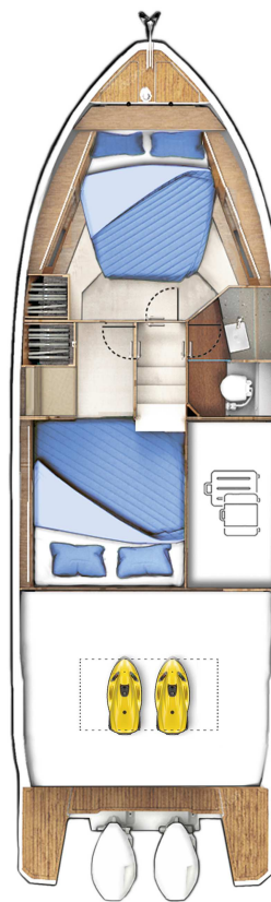
LOWER DECK standard