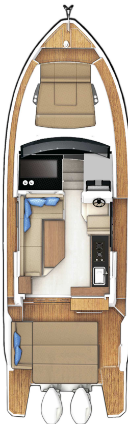
MAIN DECK optional with cockpit table to be transformed into sunpad and extended bathing platform