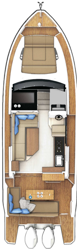
MAIN DECK optional with fixed cockpit table and extended bathing platform